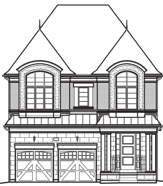
LOT NUMBER: 50 UNIT NAME: VALLEYVIEW ELEVATION: B (REV) UNIT NUMBER: 4002