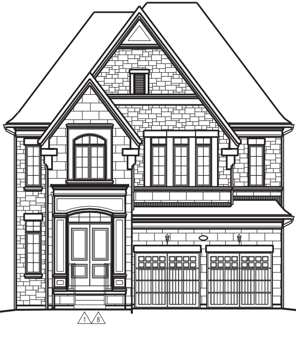
LOT NUMBER: 53 UNIT NAME: THE ROSEDALE ELEVATION: A UNIT NUMBER: 4202