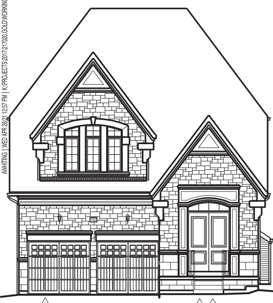
LOT NUMBER: 57 UNIT NAME: THE BRIARWOOD ELEVATION: A(REV) UNIT NUMBER: 4000