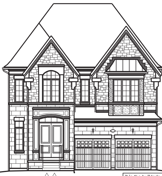
LOT NUMBER: 49 UNIT NAME: FORESTCREST ELEVATION: A UNIT NUMBER: 4203

It is the builder's complete responsibility to ensure that all plans submitted for approval fully comply with the Architectural Guidelines and all applicable regulations and requirements including zoning provisions and any provisions in the subdivision agreement. The Control Architect is not responsible in any way for examining or approving site (lotting) plans or working drawings with respect to any zoning or building code or permit matter or that any house can be properly built or located on its lot. This is to certify that these plans comply with the applicable Architectural Design Guidelines approved by the City of VAUGHAN.