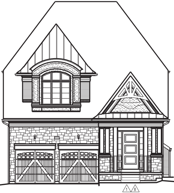
LOT NUMBER: 56 UNIT NAME: THE BRIARWOOD ELEVATION: B(REV) UNIT NUMBER: 4000