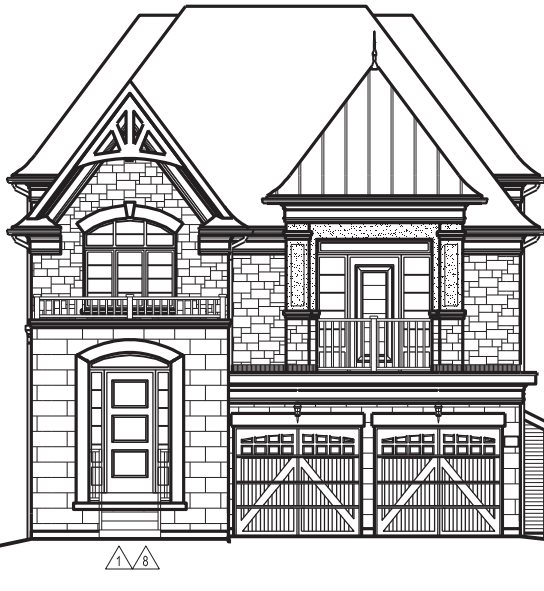
LOT NUMBER: 55 UNIT NAME: BROOKSIDE ELEVATION: B UNIT NUMBER: 4003