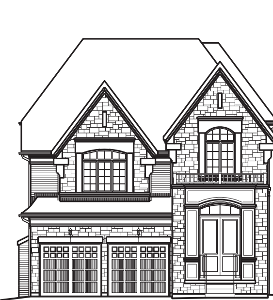
LOT NUMBER: 52 UNIT NAME: BROOKSIDE ELEVATION: A (REV) UNIT NUMBER: 4003