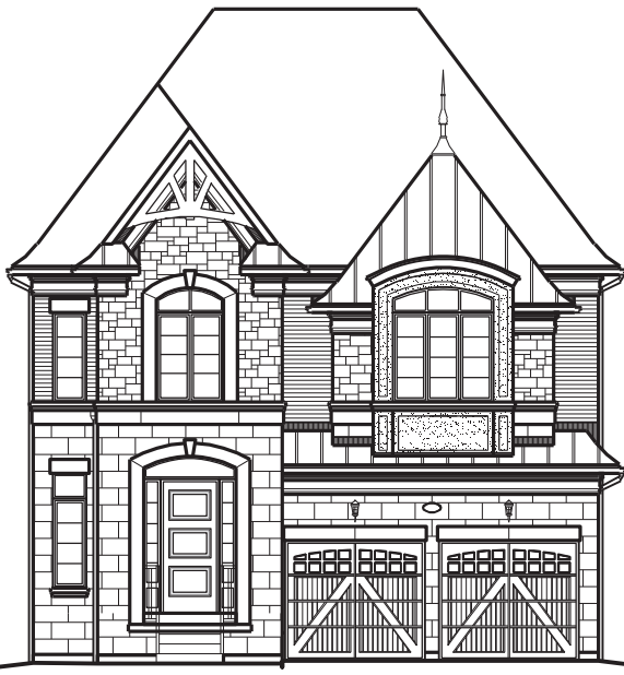
LOT NUMBER: 51 UNIT NAME: THE ROSEDALE ELEVATION: B UNIT NUMBER: 4202