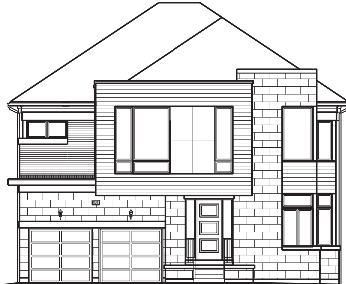
LOT NUMBER: 85 UNIT NAME: THE BEAUMONT ELEVATION: C (REV) UNIT NUMBER: 5004