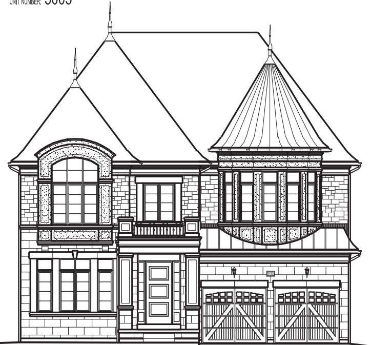
LOT NUMBER: 80 UNIT NAME: THE KNIGHTSWOOD ELEVATION: B UNIT NUMBER: 5005