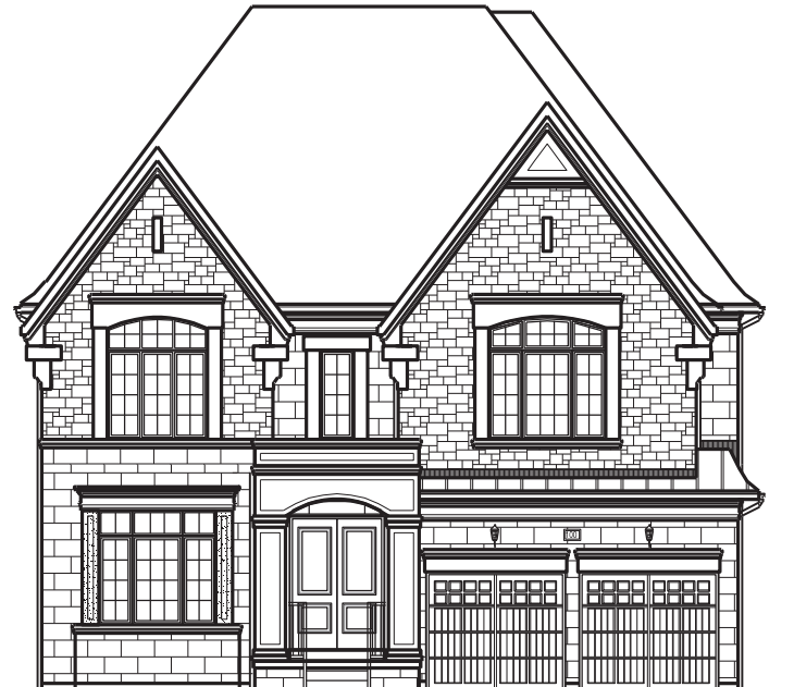
LOT NUMBER: 84 UNIT NAME: THE KNIGHTSWOOD ELEVATION: A UNIT NUMBER: 5005