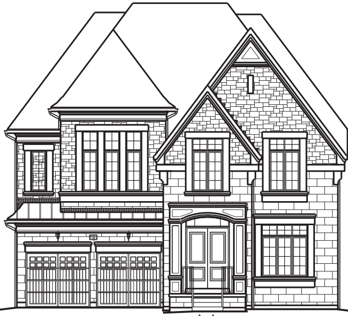
LOT NUMBER: 83 UNIT NAME: THE BEAUMONT ELEVATION: A (REV) UNIT NUMBER: 5004