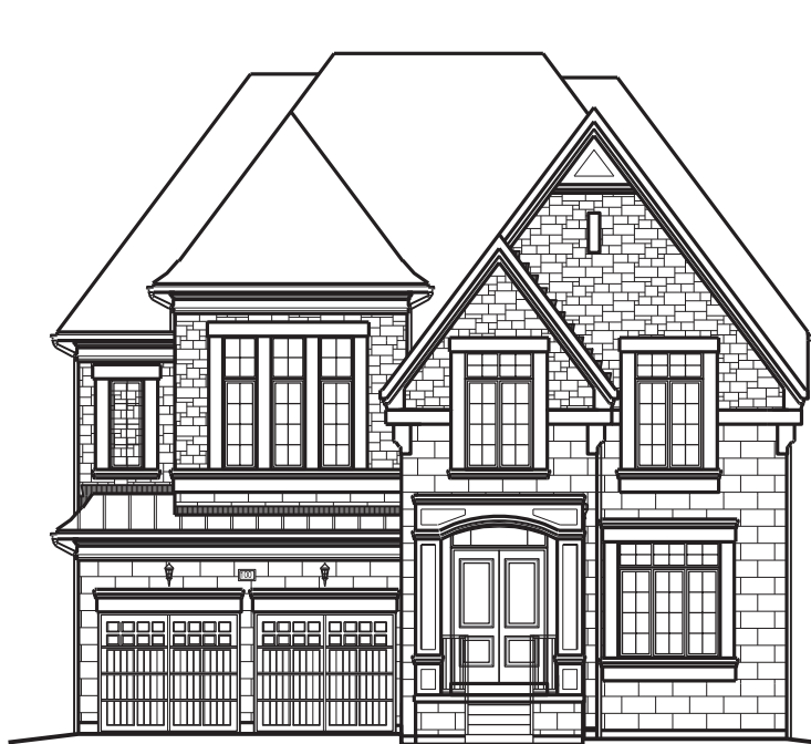
LOT NUMBER: 87 UNIT NAME: THE BEAUMONT ELEVATION: A (REV) UNIT NUMBER: 5004