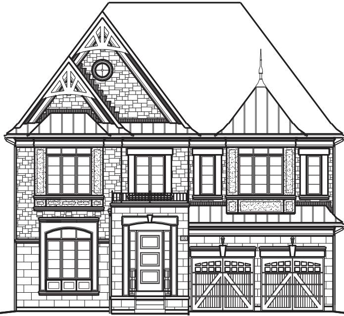
LOT NUMBER: 82 UNIT NAME: THE BEAUMONT ELEVATION: B UNIT NUMBER: 5004