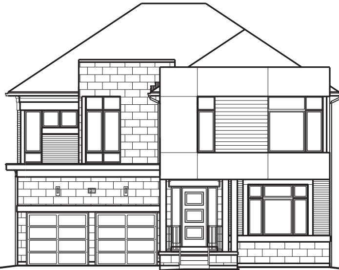
LOT NUMBER: 81 UNIT NAME: THE KNIGHTSWOOD ELEVATION: C (REV) UNIT NUMBER: 5005