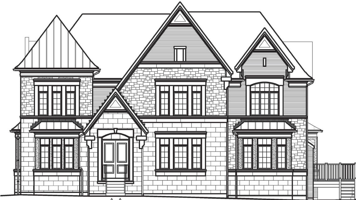
LOT NUMBER: 26 UNIT NAME: LILAC ELEVATION: A CORNER FLANKAGE (REV) UNIT NUMBER: 4006