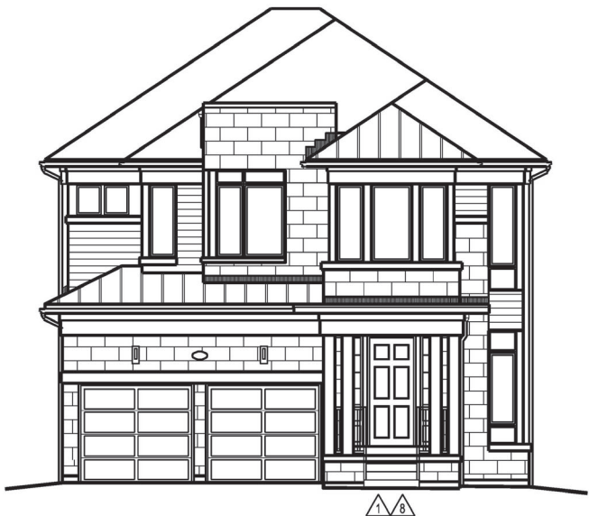
LOT NUMBER: 29 UNIT NAME: THE ROSEDALE ELEVATION: C (REV) UNIT NUMBER: 4202