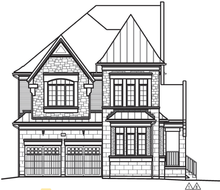
LOT NUMBER: 26 UNIT NAME: LILAC ELEVATION: A CORNER FRONT (REV) UNIT NUMBER: 4006