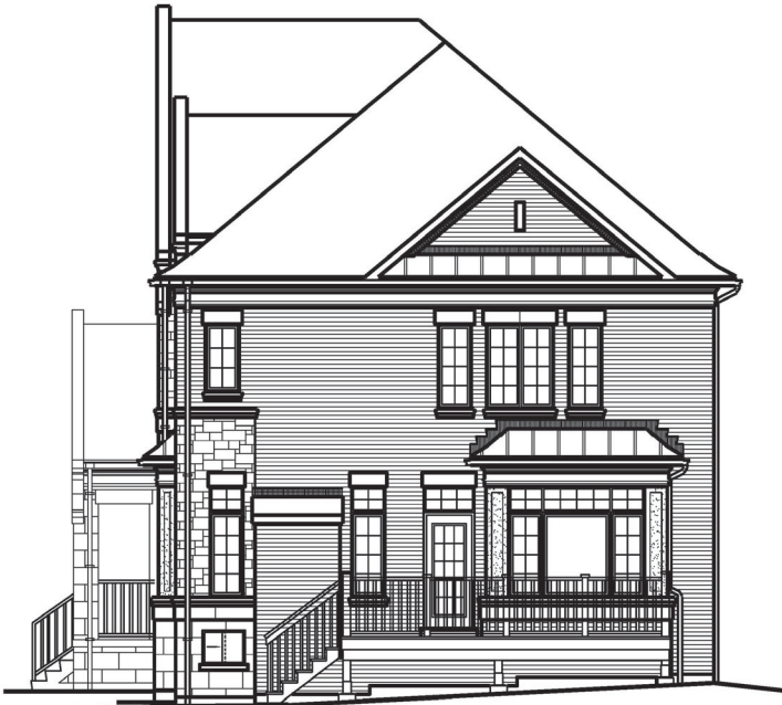
LOT NUMBER: 26 UNIT NAME: LILAC ELEVATION: A CORNER REAR (REV) UNIT NUMBER: 4006

It is the builder's complete responsibility to ensure that all plans submitted for approval fully comply with the Architectural Guidelines and all applicable regulations and requirements including zoning provisions and any provisions in the subdivision agreement. The Control Architect is not responsible in any way for examining or approving site (lotting) plans or working drawings with respect to any zoning or building code or permit matter or that any house can be properly built or located on its lot. This is to certify that these plans comply with the applicable Architectural Design Guidelines approved by the City of VAUGHAN.