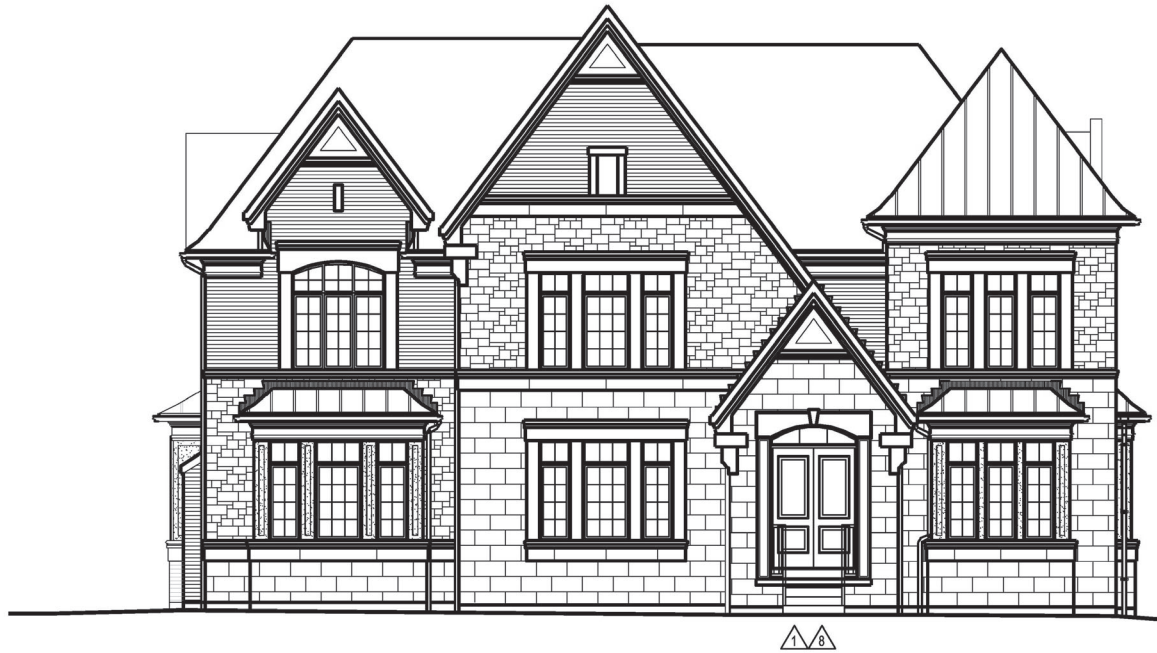
LOT NUMBER: 30 UNIT NAME: LILAC ELEVATION: A CORNER FLANKAGE UNIT NUMBER: 4006