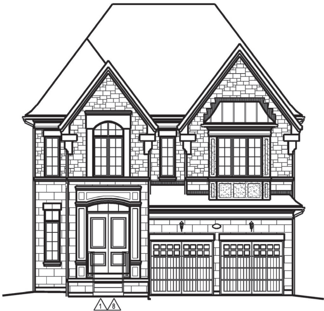
LOT NUMBER: 27 UNIT NAME: FORESTCREST ELEVATION: A UNIT NUMBER: 4203