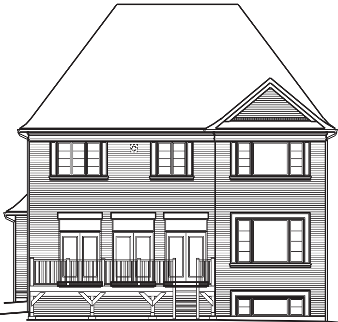
LOT NUMBER: 99 UNIT NAME: OAKGROVE ELEVATION: B UNIT NUMBER: 5003