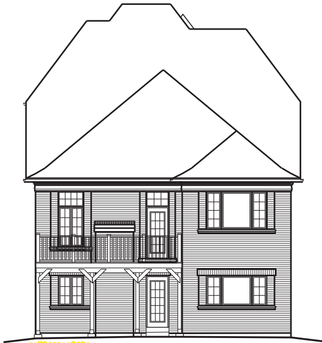
LOT NUMBER: 102 UNIT NAME: MAPLEWOOD ELEVATION: A (REV) UNIT NUMBER: 4201