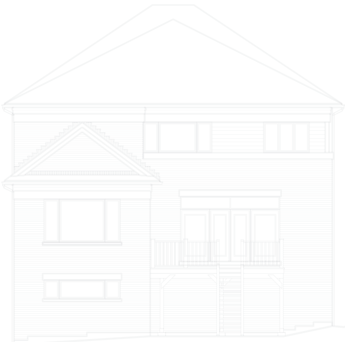
LOT NUMBER: 103 UNIT NAME: THE BEAUMONT ELEVATION: REAR EL. C UNIT NUMBER: 5004