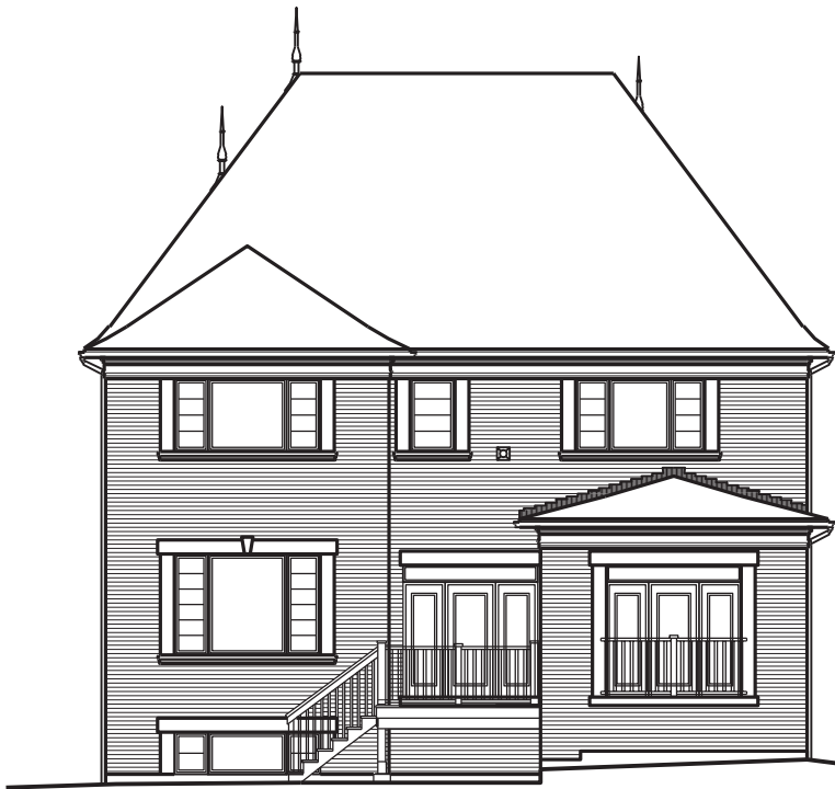
LOT NUMBER: 98 UNIT NAME: THE KNIGHTSWOOD ELEVATION: B (REV) UNIT NUMBER: 5005