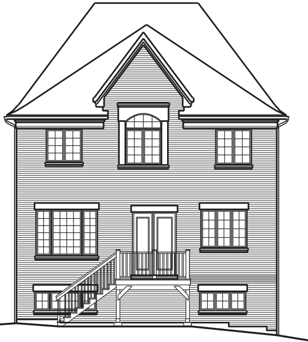
LOT NUMBER: 100 UNIT NAME: FORESTCREST ELEVATION: A (REV) UNIT NUMBER: 4203