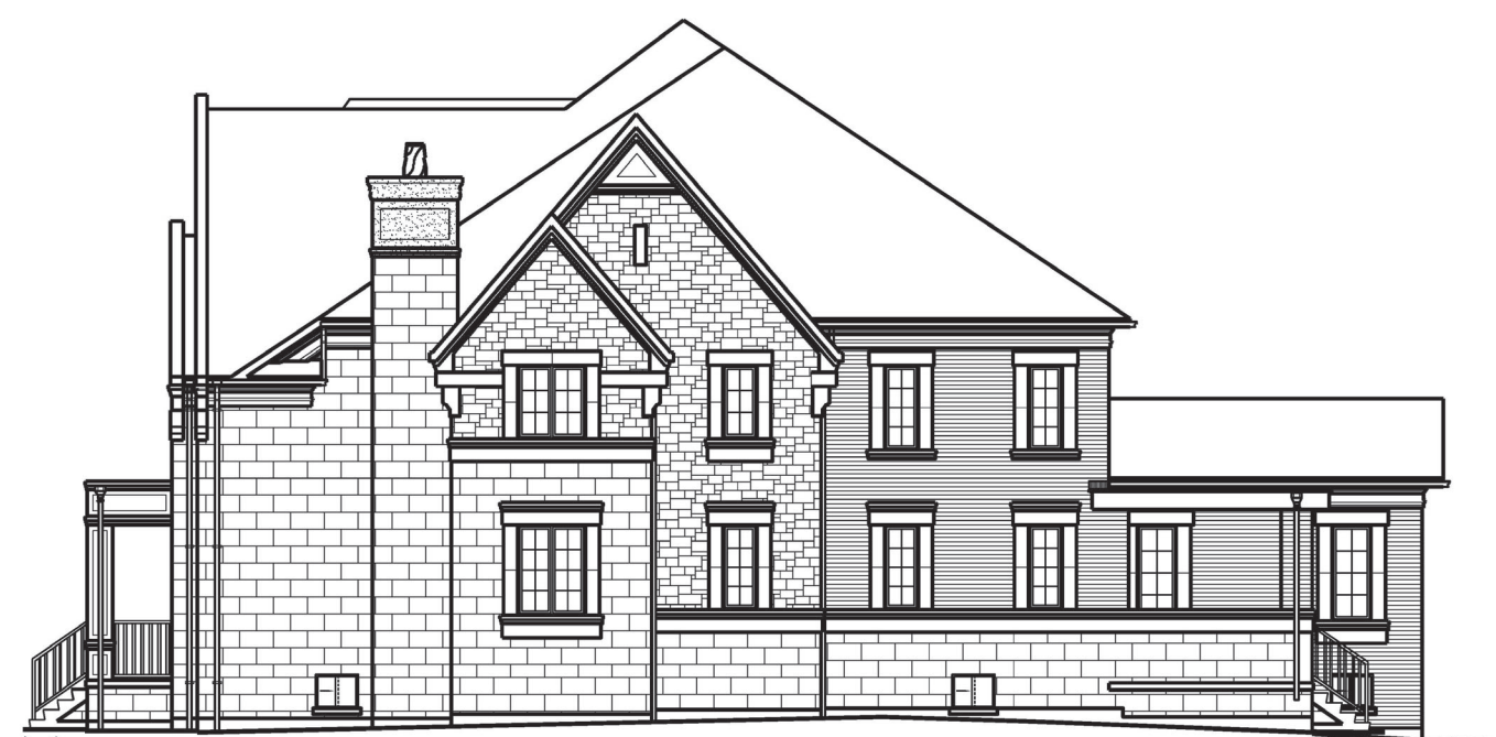
LOT NUMBER: 1 UNIT NAME: THE BEAUMONT ELEVATION: A CORNER FLANKAGE-LOGGIA(REV) UNIT NUMBER: 5004