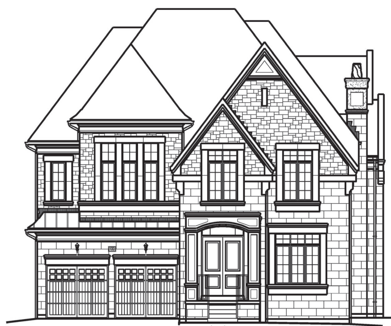
LOT NUMBER: 1 UNIT NAME: THE BEAUMONT ELEVATION: A CORNER FRONT(REV) UNIT NUMBER: 5004