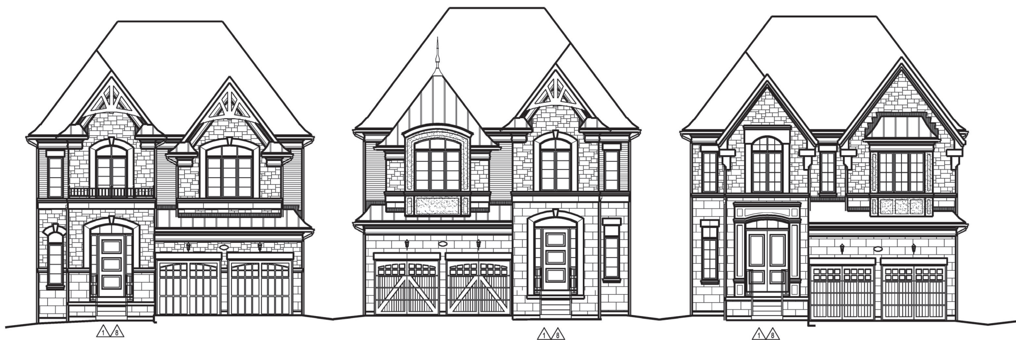
LOT NUMBER: 4 UNIT NAME: FORESTCREST ELEVATION: B UNIT NUMBER: 4203