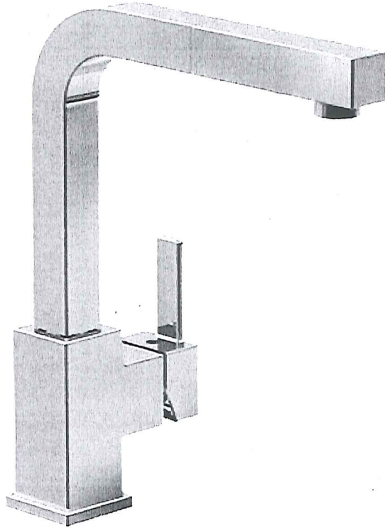
40878 – Pranzo Kitchen Faucet with Pull Out Spray