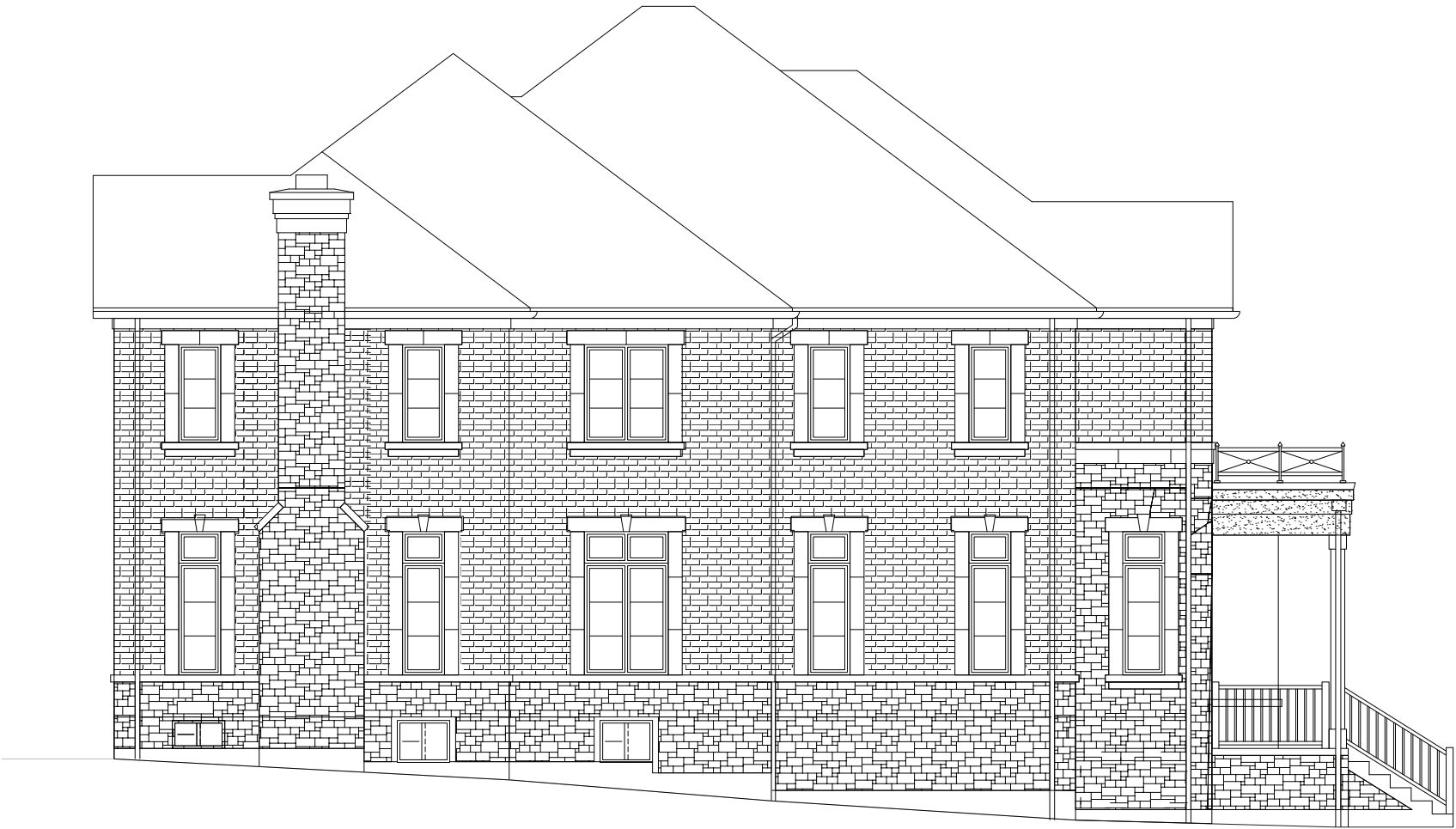
FLANKAGE ELEVATION 'A'