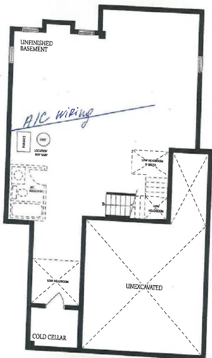
Basement Elevation A