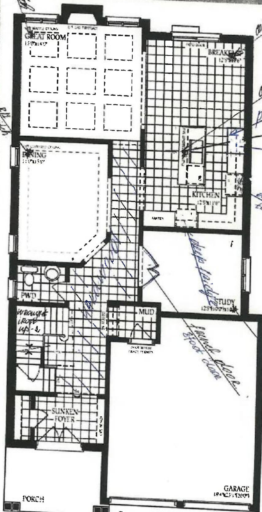
Ground Floor Elevation A