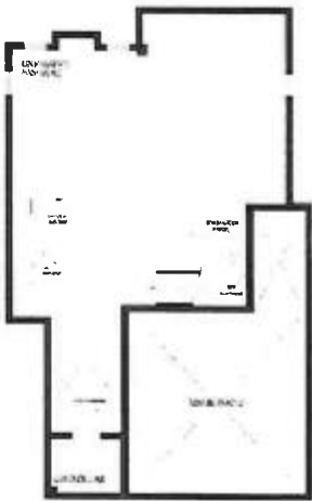
Basement Elevation A