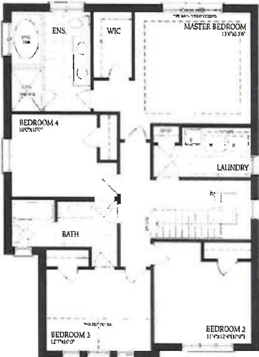
Second Floor Elevation A