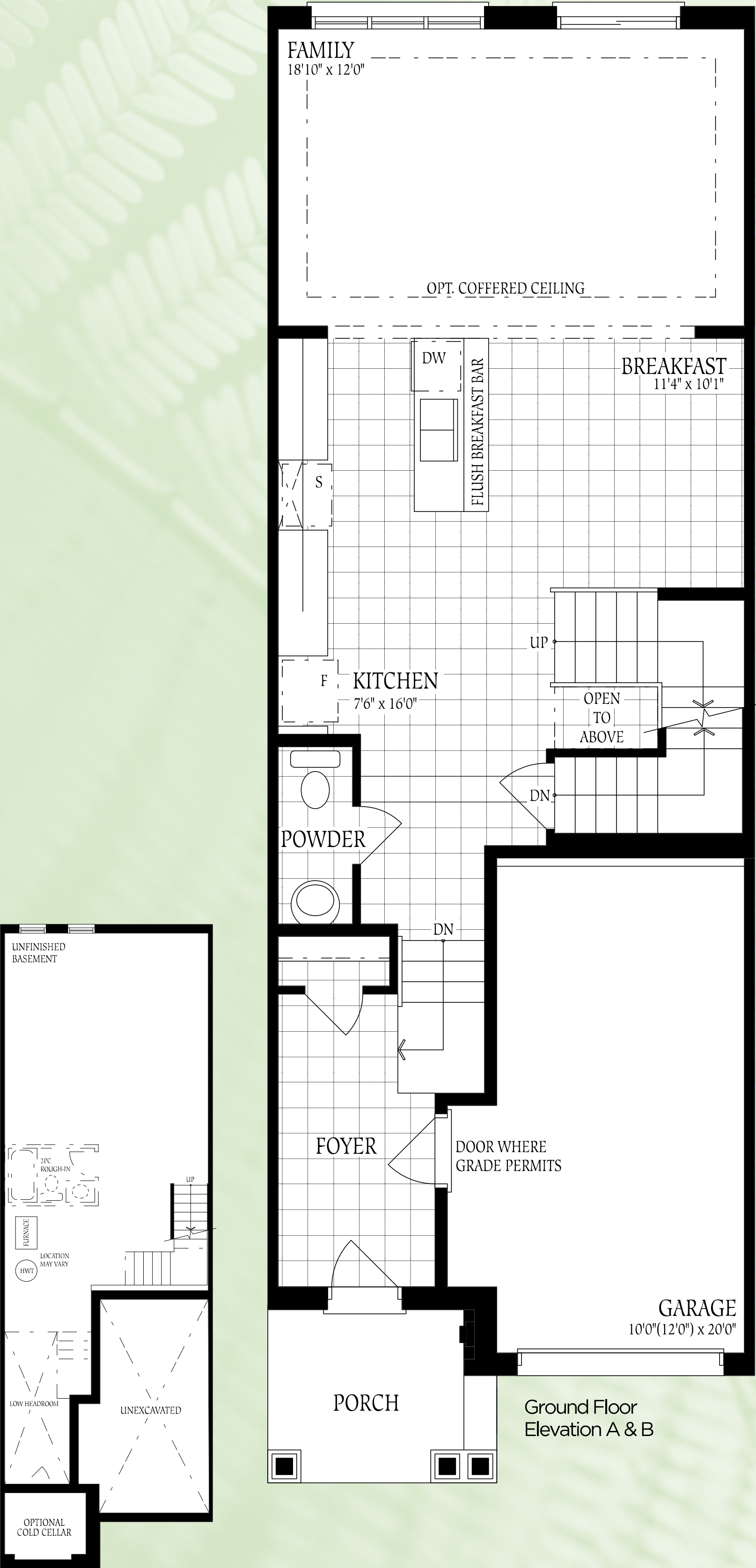
Basement Elevation A & B