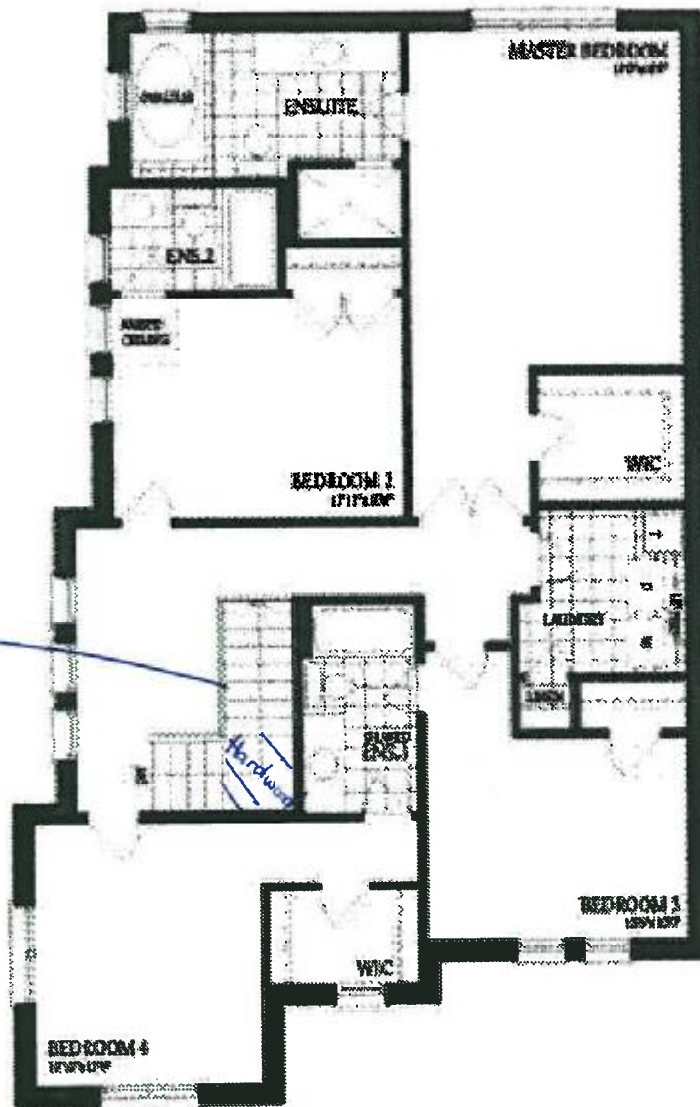
SECOND FLOOR ELEVATION A