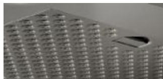
stainless steel micro hole filters