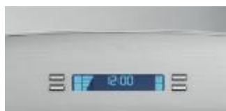
multi-function electronic controls with LCD display