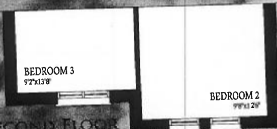
SECOND FLOOR ELEV. B MOD