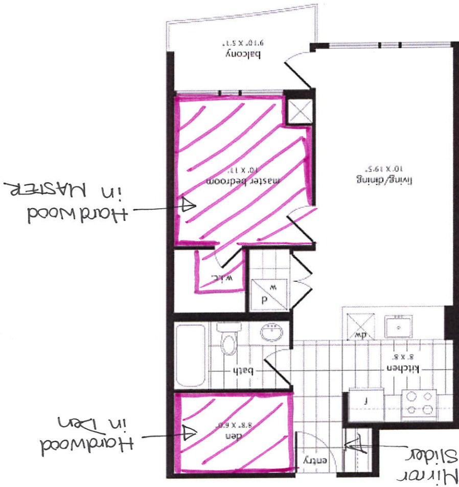
Floor Plan: Robin

4099 Brickstone Mews, Mississauga, ON, Suite # 3305 Unit # 5 Level 32.00 Floor Plan Robin PURCHASER: ISAAC S MATTA